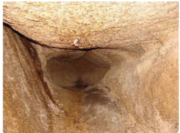
Fig. 2. Tubo en el nacimiento de un manantial estacional subterráneo. Cota -13 m. Cueva de A Furna, Castelo de A Furna, Valença (Portugal)

These systems have been developed taking advantage of the discontinuity system of the granite massif. The formation of the cavity is carried out in two stages. During the first one, the subedaphic weathering advances in depth along the system of discontinuities encompassed with the incision of the drainage network (ruled by isostatic, eustatic or tectonic movements). Weathering produces alterites associated with the discontinuities that later lead the water infiltration.