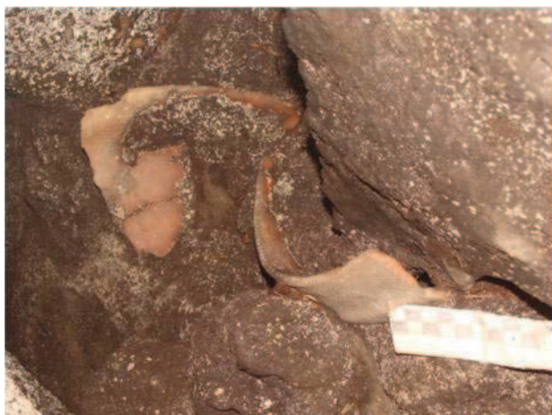
Fig. 3. Cerámica en el nivel TL 7,05 +/-0,86 kyrBP. Cota -37 m. Sistema de A Trapa, Ribadelouro-Tui (Galicia, España)

Cave art is preserved on a tafone located at the Barruecos de Malpartida (Cáceres). Also, in Matobo Hill's (Zimbabwe), UNESCO heritage, where numerous caves and rocky shelters in granite contain Paleolithic sites and preserve cave art.